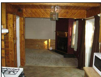
fireplace in living room