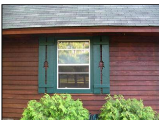
up north charm